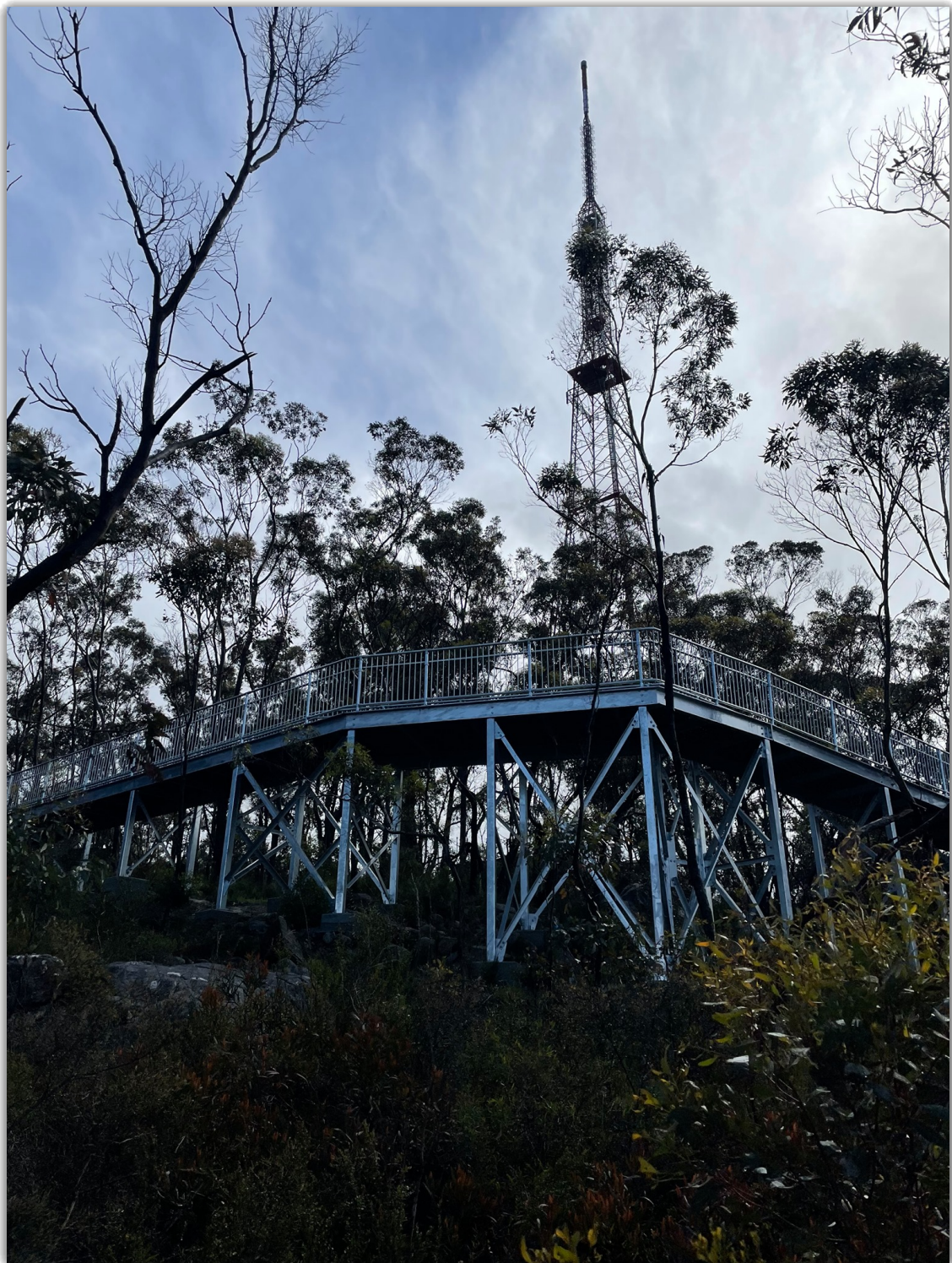
Photo: Tower Hill, Mount Barker